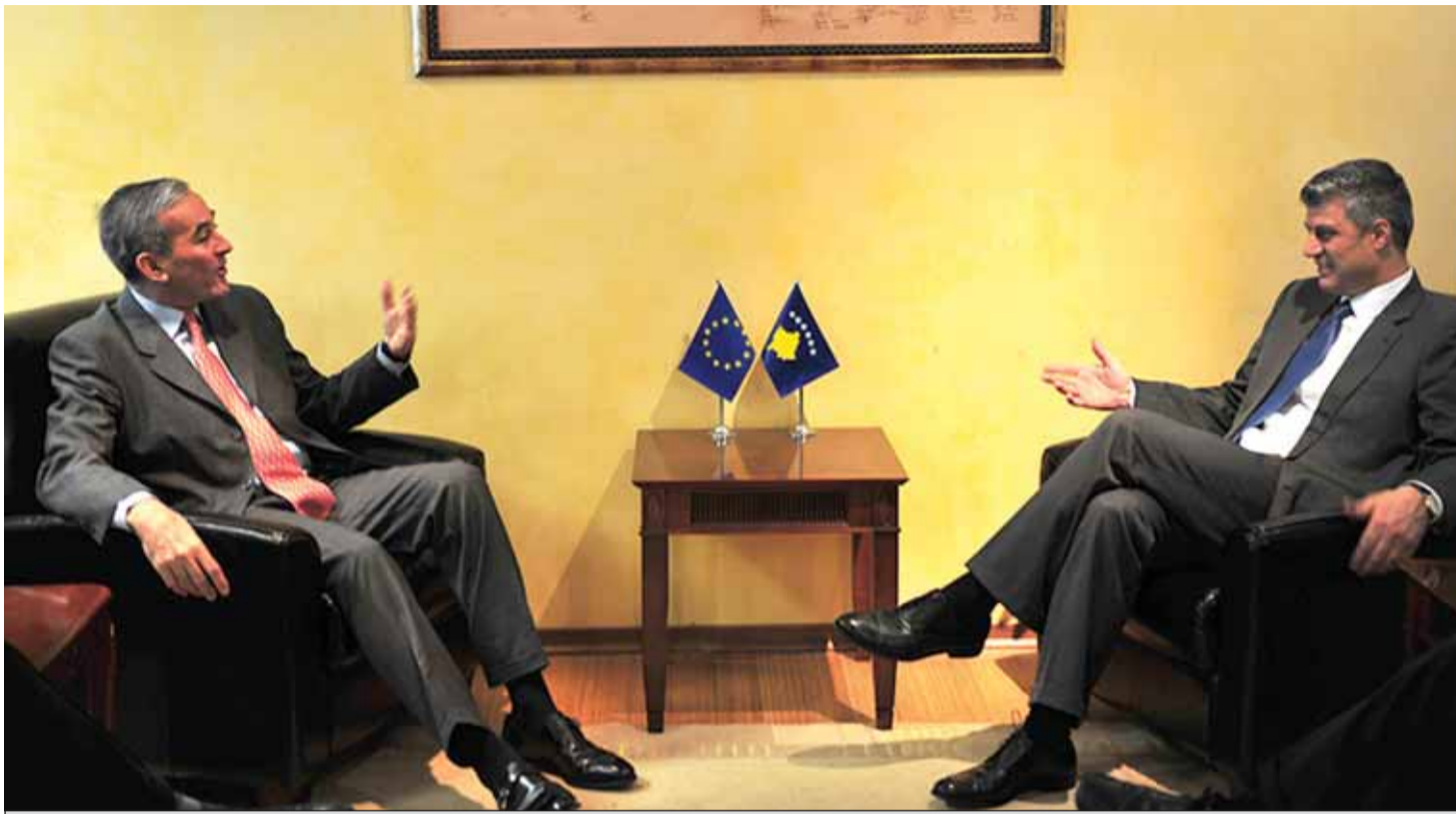
EULEX head Yves de Kermabon and Prime Minister Hashim Thaci. Relations between EULEX and Kosovo's government have been strained over the 'Limaj Case'