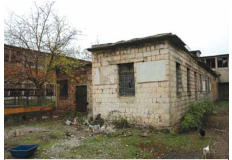
The prison allegedly used by the KLA in Kukes, Albania

They believe that the detainees were seized in different parts of Albania and sent to a detention facility in Kukes and a former