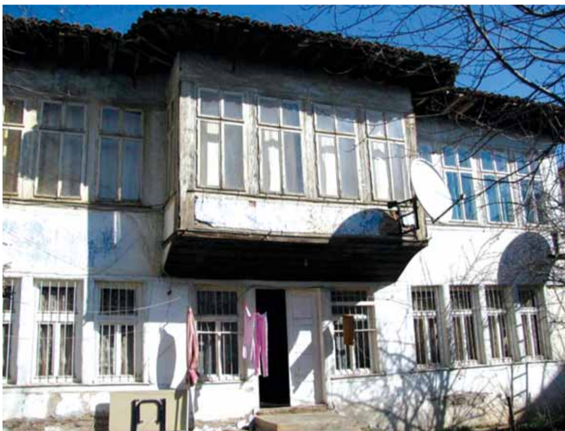
The Hyniler House in Prishtina's Old Town has been under threat of demolition

Conservation experts told Prishtina Insight that the Hyniler house is just one of many threatened buildings in the city and called for greater protection of