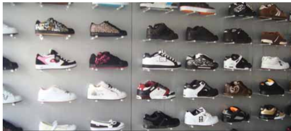
Billabong has a wide selection of trainers on offer

Surf, Skate, Snow and Wake is the motto of the Australian apparel and accessory brand Billabong, which has become a staple in alternative sportswear.