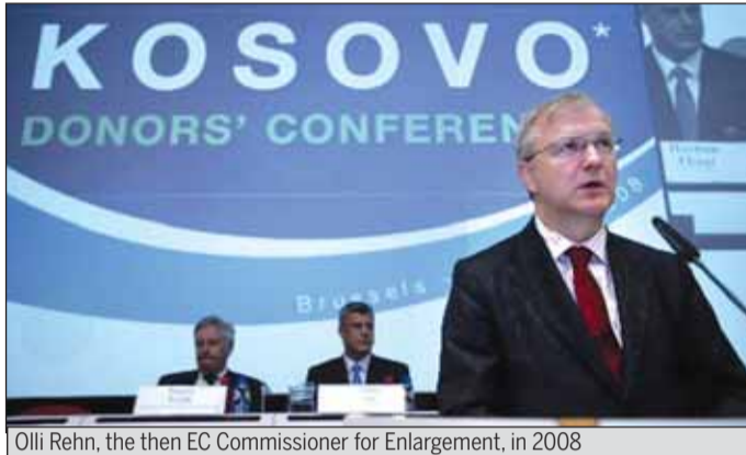
Olli Rehn, the then EC Commissioner for Enlargement, in 2008

Government spokesman Memli Krasniqi added there was no risk of Kosovo losing