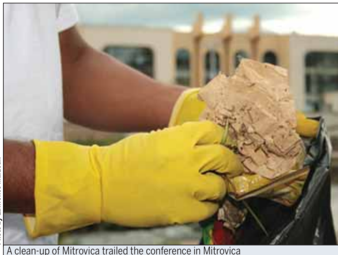
A clean-up of Mitrovica trailed the conference in Mitrovica

The Mitrovica Forum, comprising nine members from both south and north Mitrovicë/Kosovska Mitrovica, is hosting the conference, with the support of the University of Massachusetts and the Northern Ireland Foundation.