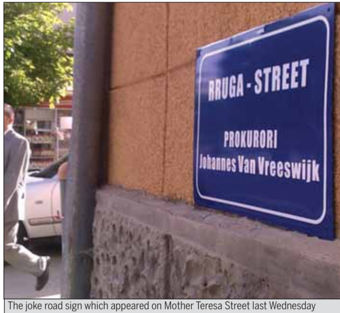
The joke road sign which appeared on Mother Teresa Street last Wednesday

The 'Johannes Van Vreeswijk Street' on the other hand was given a more positive reception, especially among the 4000 members of the Facebook group 'We