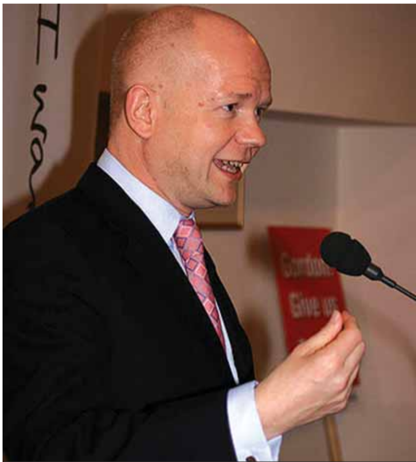
William Hague - Britain's new Foreign Secretary

He wrote: "The consequences of Bosnia's disintegration would be catastrophic. The breakdown of the country into independent ethnic statelets would not only reward ethnic cleansing - surely a