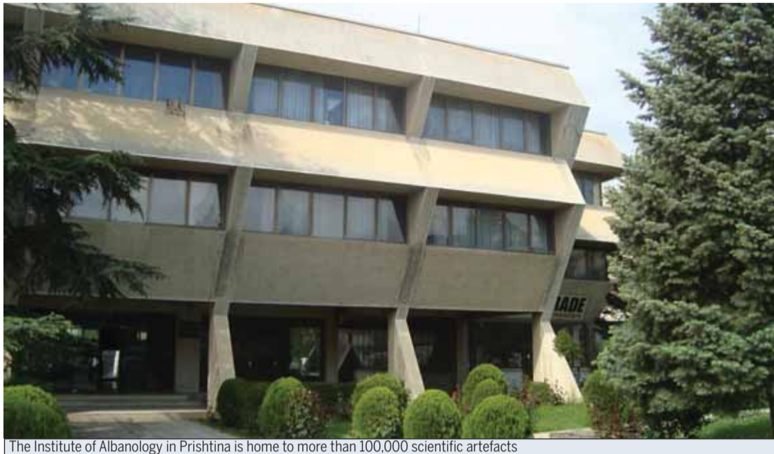
The Institute of Albanology in Prishtina is home to more than 100,000 scientific artefacts

As further autonomy was transferred from Belgrade to Kosovo during the late sixties and seventies, the institute moved into the building that it currently occu-