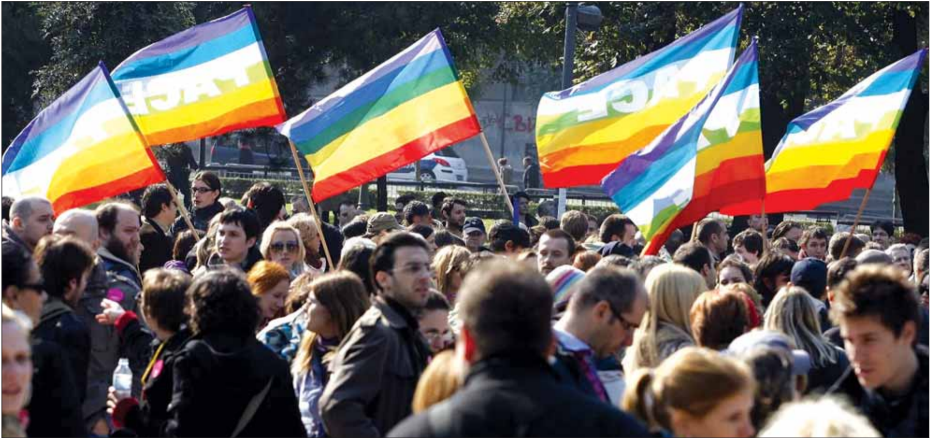
The Pride Parade was hemmed into a safe zone to protect the procession from right-wing protesters

attempts to sabotage Pride Parades in Croatia, Serbia and other Balkan countries, even though anti-discrimination laws exist to stop them.