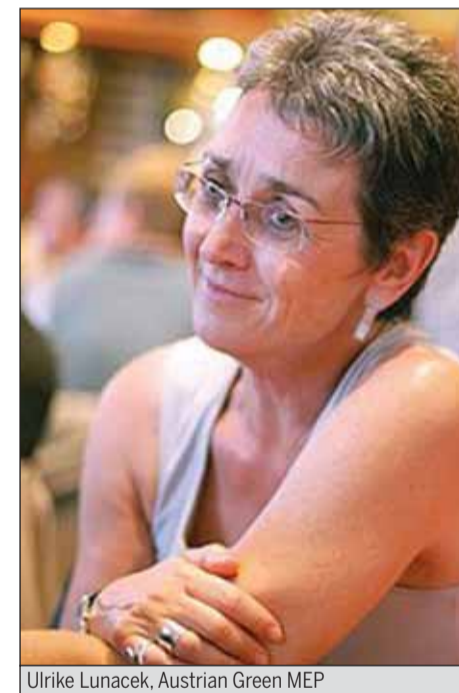
Ulrike Lunacek, Austrian Green MEP

Citing claims about 'the political situa-