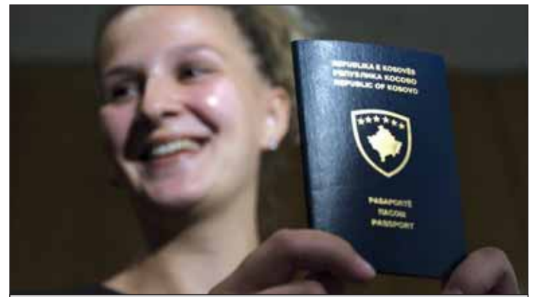
Kosovars hope to travelling visa free across Europe soon

Visa liberalisation for Serbia, Montenegro and Macedonia was granted in January this year and led to a spike in asylum claims in