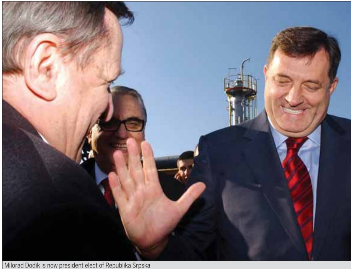
Milorad Dodik is now president elect of Republika Srpska

Ivanic's near miss was a surprise. The articulate former prime minister of the Republika Srpska and former foreign minister of Bosnia, an academic who has spent spells in the UK and Germany, was widely seen as more comfortable in Western diplomatic circles than pressing the flesh in a tough election cam-