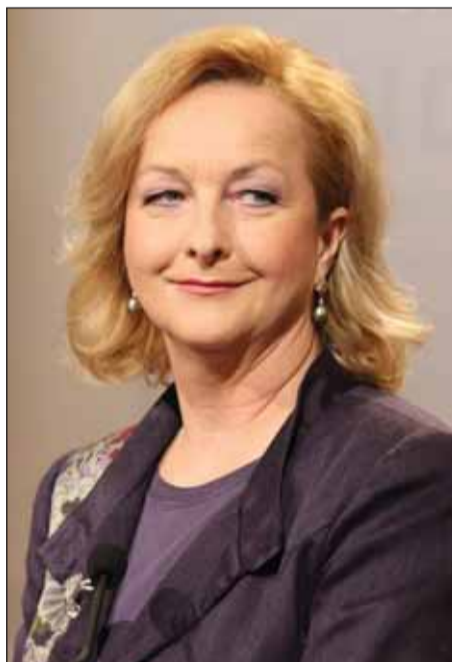
Maria Fekter, Austria's Interior Minister