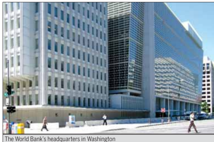
The World Bank's headquarters in Washington

But according to some, there is a risk that the implementation of