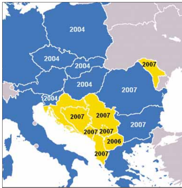
A CEFTA map showing when countries left and joined the agreement