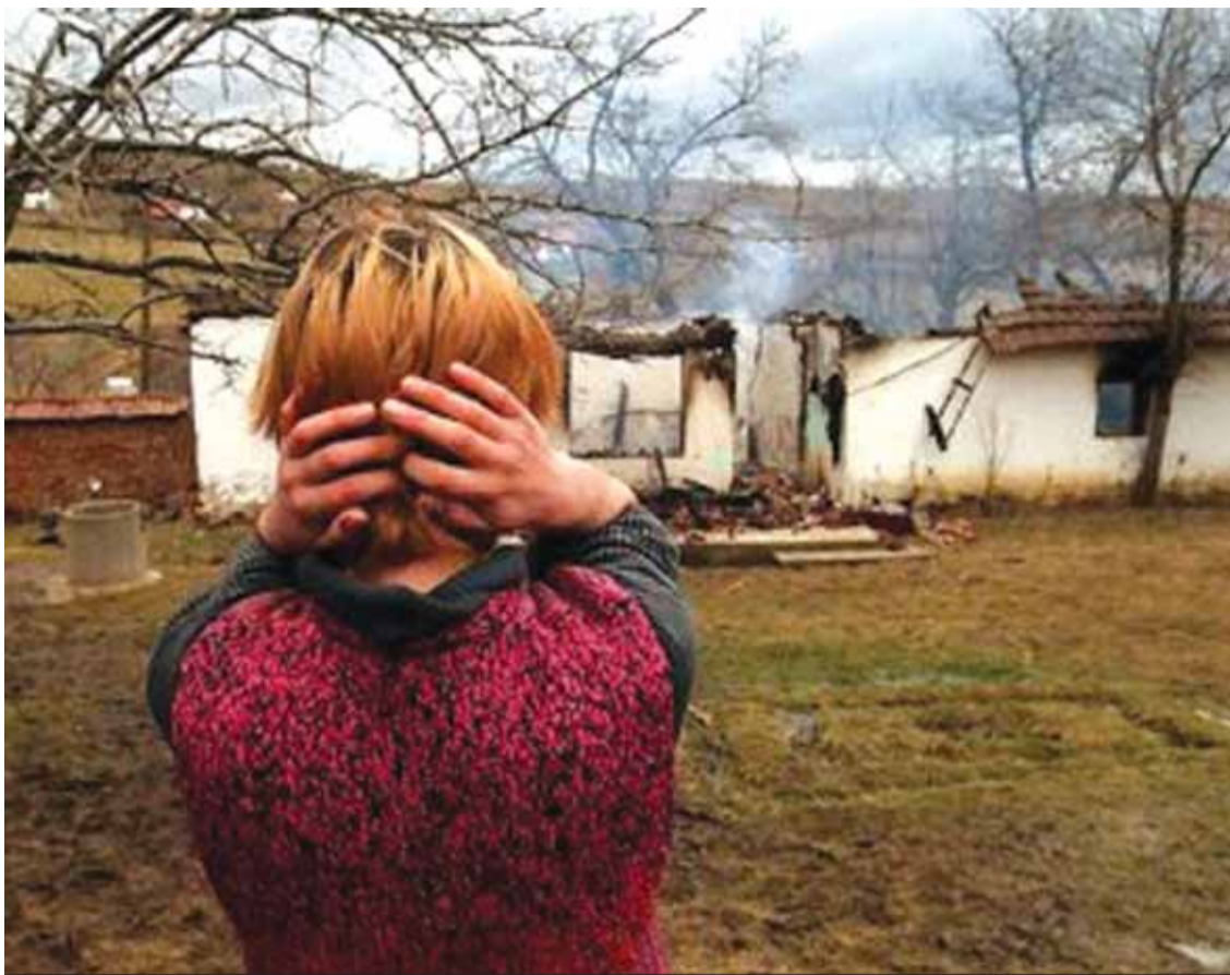
A woman looks onto her burnt home during the Kosovo conflict