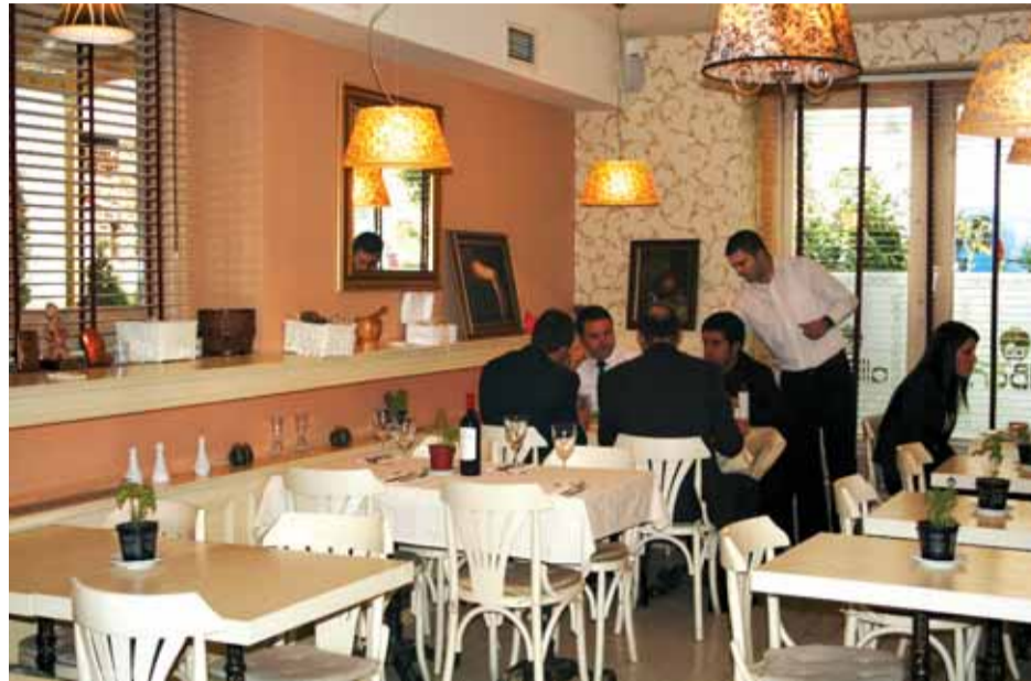
The atmosphere in Allbar is all bar none

For dessert, the restaurant presents the standard choice of tiramisu and 'chess cake'. But then again, why