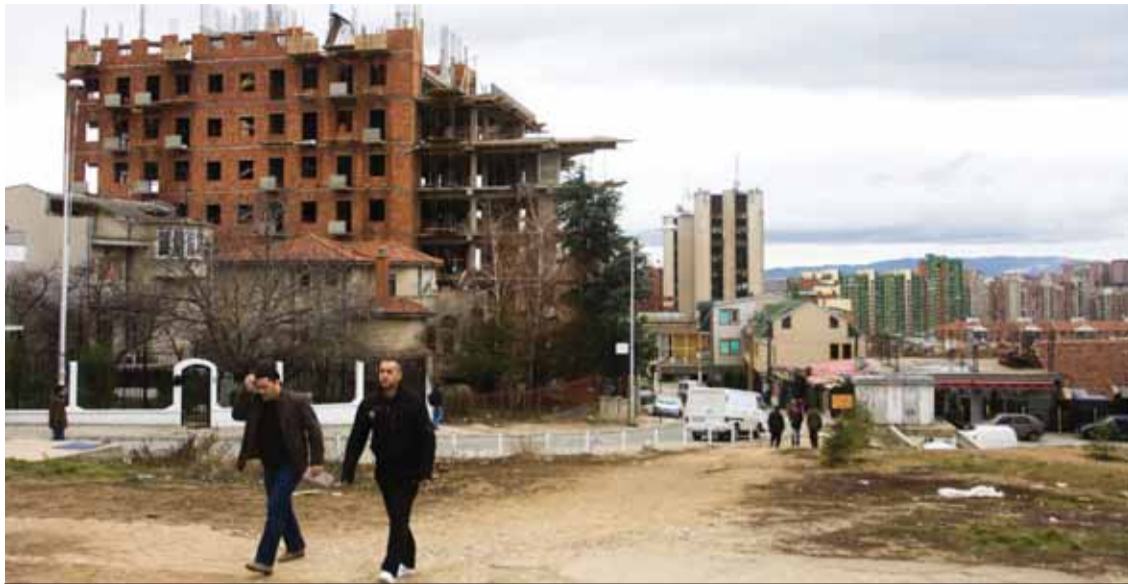
Prishtina Municipality hopes to rein in the city's uncontrolled building boom