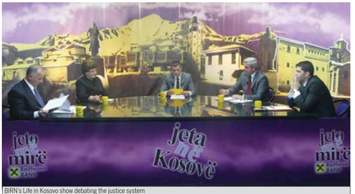
BIRN's Life in Kosovo show debating the justice system

Before the start of the hearing on court case C.no 1524/09,