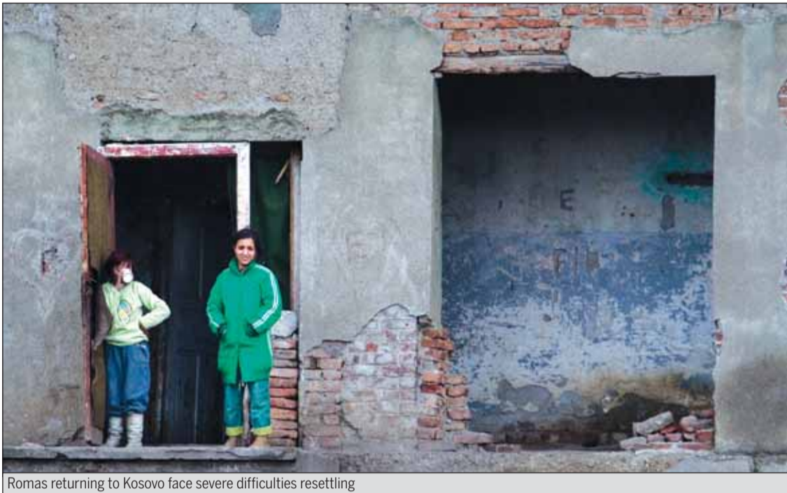
Romas returning to Kosovo face severe difficulties resettling

tion' or the economic crisis do not work anymore in Western countries, he noted.