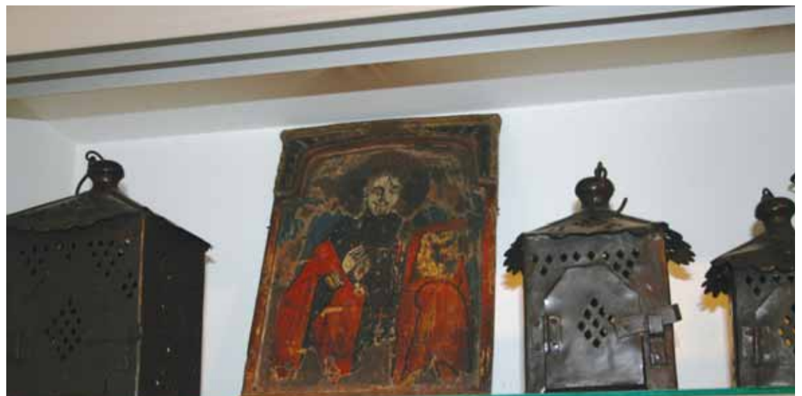
Some of Baruka's treasures