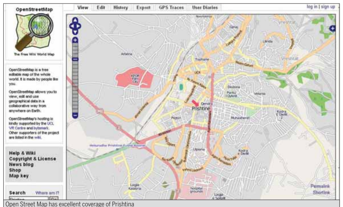
Open Street Map has excellent coverage of Prishtina

This work was outlined at last month's conference Software Freedom Kosova 2010, organised by local group Kosovar Association for Free/Libre and