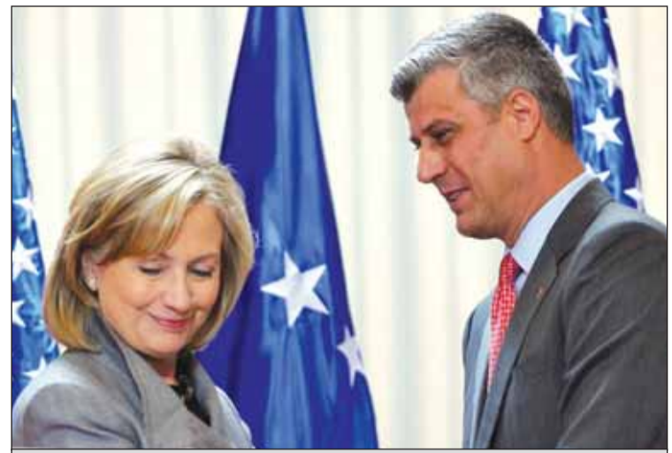
Thaci and Clinton at a joint press conference in Prishtina

PM Thaci reiterated that Kosovo has expressed a readiness and willingness to build good inter-state relations with Serbia as two inde-