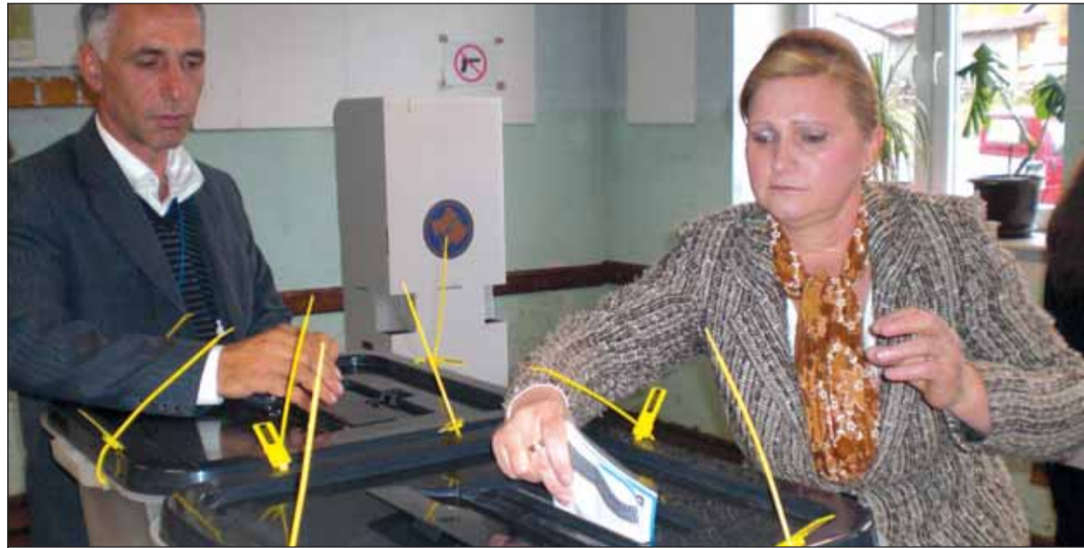
Voters are expected to go to the polls in February, but a question mark hangs over whether Kosovo's biggest party will be able to participate

Opposition says they will ask the Constitutional Court to rule on whether the Democratic Party of Kosovo has broken the rules by not holding internal elections within last three years.