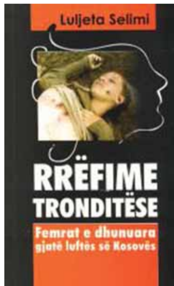
Luljeta Selimi's book on the conflict

During the weekend, however, the team often put in a 12-hour day, travelling across Kosovo to speak to women, check on their health and deliver food and clothes.